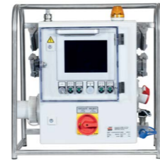
Technical modification reserved