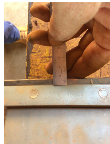
Blade showing 7mm at lowest point remaining after 20 weeks