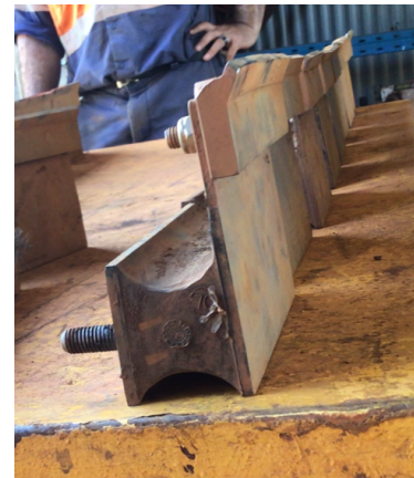
Belt Cleaner profile after 20 weeks