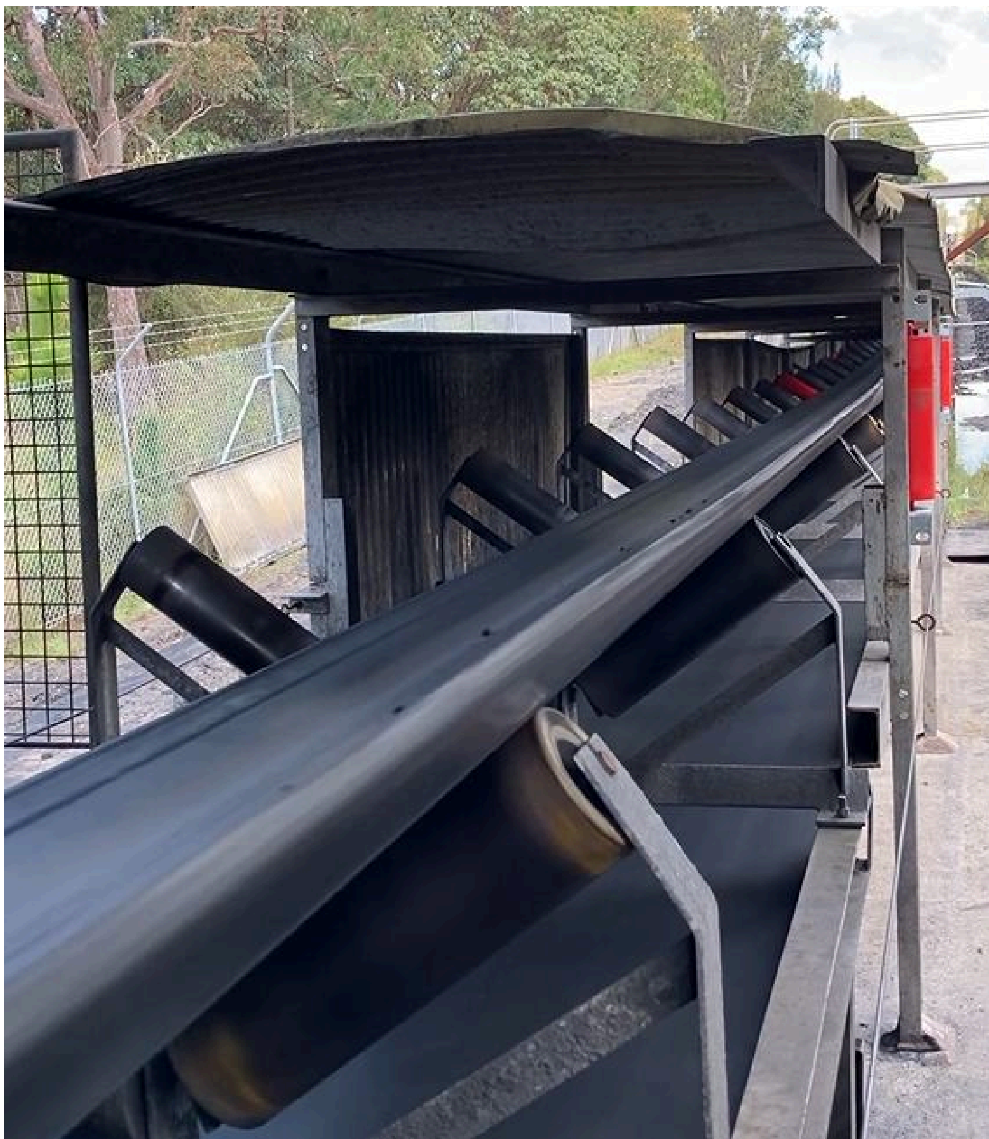
Tracking before installation of REMATRACK TTX